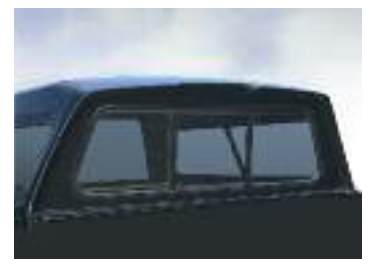
Removable Front Picture Window