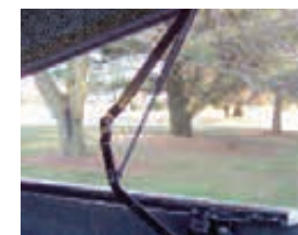
LEER SuperLift System