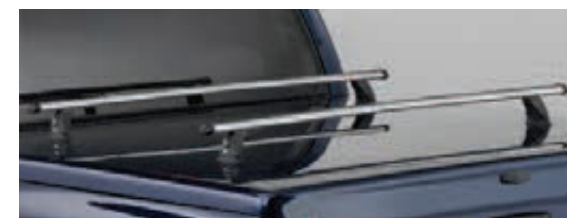
Thule® AeroBlade Roof Rack (optional)