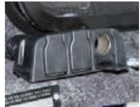
3-Outlet 12V Powerblock