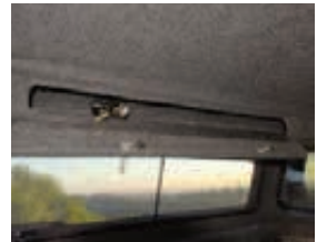
Locking Overhead Storage Box