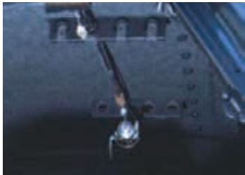
Fishing Rod Holder