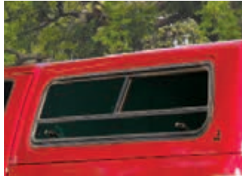
Side Window Slider