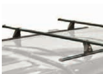
Thule® Tracker II Roof Rack with Locks