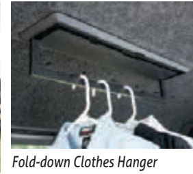
Fold-down Clothes Hanger