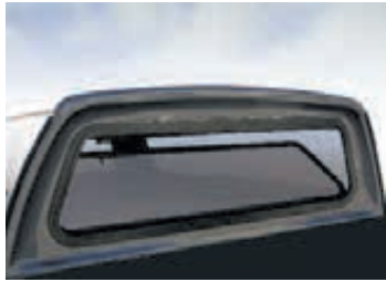
Removable Front Picture Window