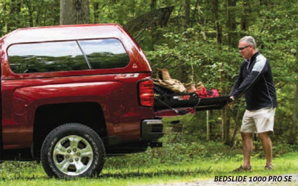
BEDSLIDE 1000 PRO SE