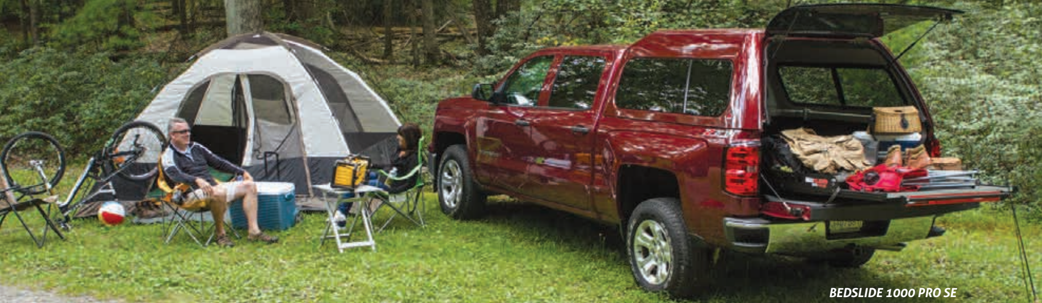
BEDSLIDE 1000 PRO SE