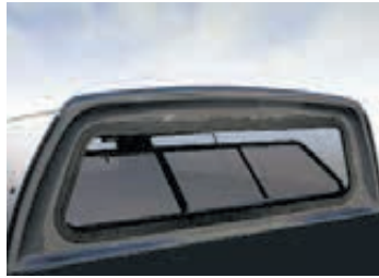
Removable Front Slider