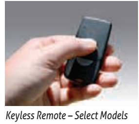
Keyless Remote – Select Models