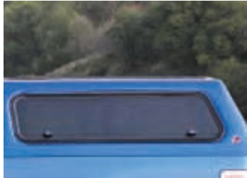
Radius Side Window