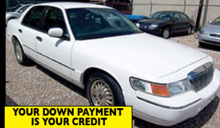
YOUR DOWN PAYMENT IS YOUR CREDIT 00 Mercury Grand Marquis Auto, V8, CD, Alloys, Cold AC, All Pwr Equip