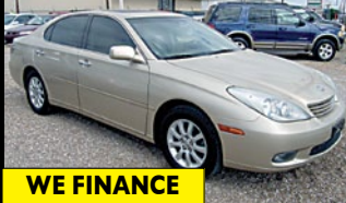
WE FINANCE 03 Lexus ES300 Auto, Leather, CD, Sunroof, All Power Equip