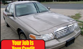
Your Job is Your Credit 01 Ford Crown Victoria 27K Original Miles, Auto, V8, CD, Alloys