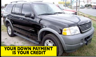
YOUR DOWN PAYMENT IS YOUR CREDIT 04 Ford Explorer Eddie Bauer V8, Auto, Leather