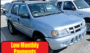
Low Monthly Payments 03 Isuzu Rodeo Auto, AC, Clean, All Power Equip