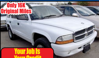
Only 16K Original Miles Your Job is Your Credit 03 Dodge Durango SLT Auto, V8, CD, Alloys, All Power Equip