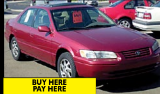
BUY HERE PAY HERE 97 Toyota Camry Auto, Leather, Sunroof