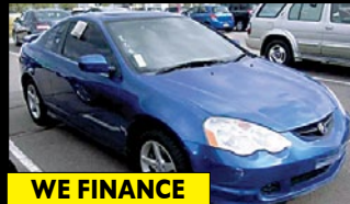
WE FINANCE 03 Acura RSX CD, Alloys, All Pwr Equipment