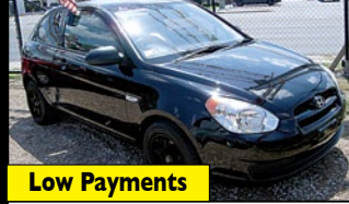
Low Payments 05 Hyundai Accent AC, Standard, Alloys, CD