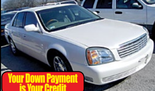
Your Down Payment is Your Credit 02 Cadillac DHS Auto, V8, Leather, CD, Alloys, All Pwr Equip