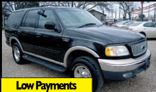
Low Payments 99 Ford Expedition Eddie Bauer, Low Miles