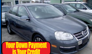
Your Down Payment is Your Credit 05 Volkswagen Jetta Auto, Leather, Sunroof, Alloys