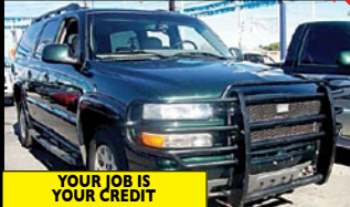
YOUR JOB IS YOUR CREDIT 02 Chevy Suburban LS Auto, Leather, CD, Alloys, All Pwr Equipment