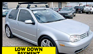
LOW DOWN PAYMENT 03 Volkswagen GTI V6, Low Miles, Sunroof