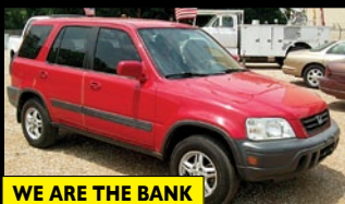
WE ARE THE BANK 00 Honda CR-V Auto, CD, AC, All Power