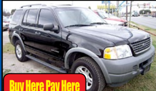
Buy Here Pay Here 02 Ford Explorer Standard, AC, Alloys, All Pwr