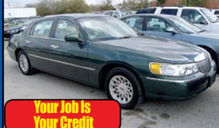
Your Job is Your Credit 98 Lincoln Town Car Signautre Series, Leather, CD, Low Miles