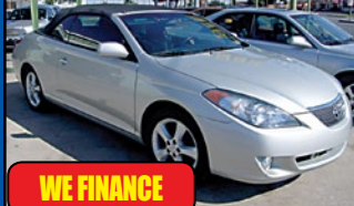
WE FINANCE 05 Toyota Solara Convertible, Auto