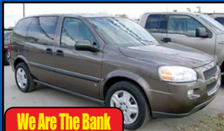
We Are The Bank 08 Chevy Uplander Auto, V6, CD, Alloys, All Pwr Equip