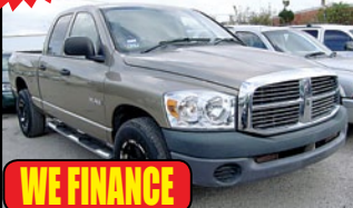
WE FINANCE 08 Dodge Ram 1500 Quad Cab Custom Alloys, All Power Equip

Clean, Dependable Used Cars • Limpios, Confiables Autos Usados 35 Years Of Experience • Tenemos 35 Años de Experiencia LOT ONE LOT TWO